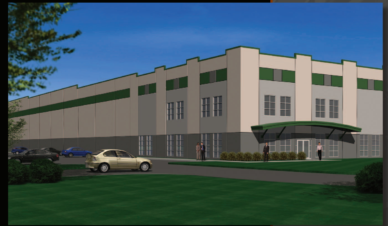
Cumberland County (Carlisle), Pennsylvania